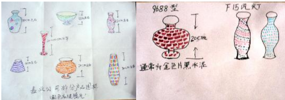
Product Sample Diagrams

First, let's introduce the production process of this slave labor.