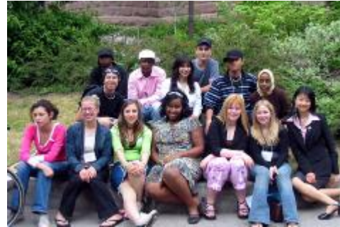
Some young representatives attending the meeting